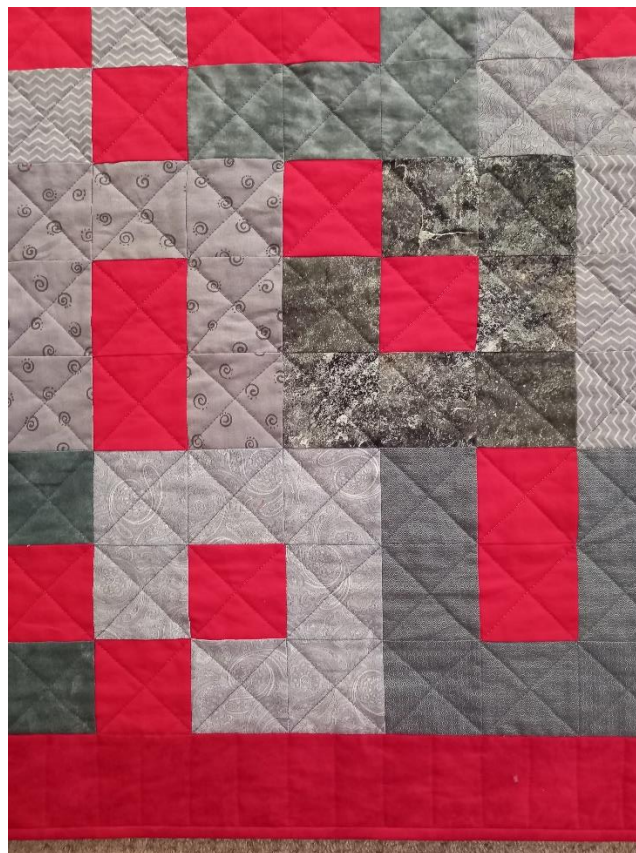
Figure 3. Cross-hatch quilting in the squares, piano-key quilting along the border.

Although the design is based on nine-patch blocks, the best result is achieved by sewing the square patches in rows.